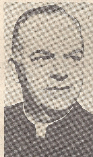
JOHN CARDINAL DEARDEN Detroit Archbishop