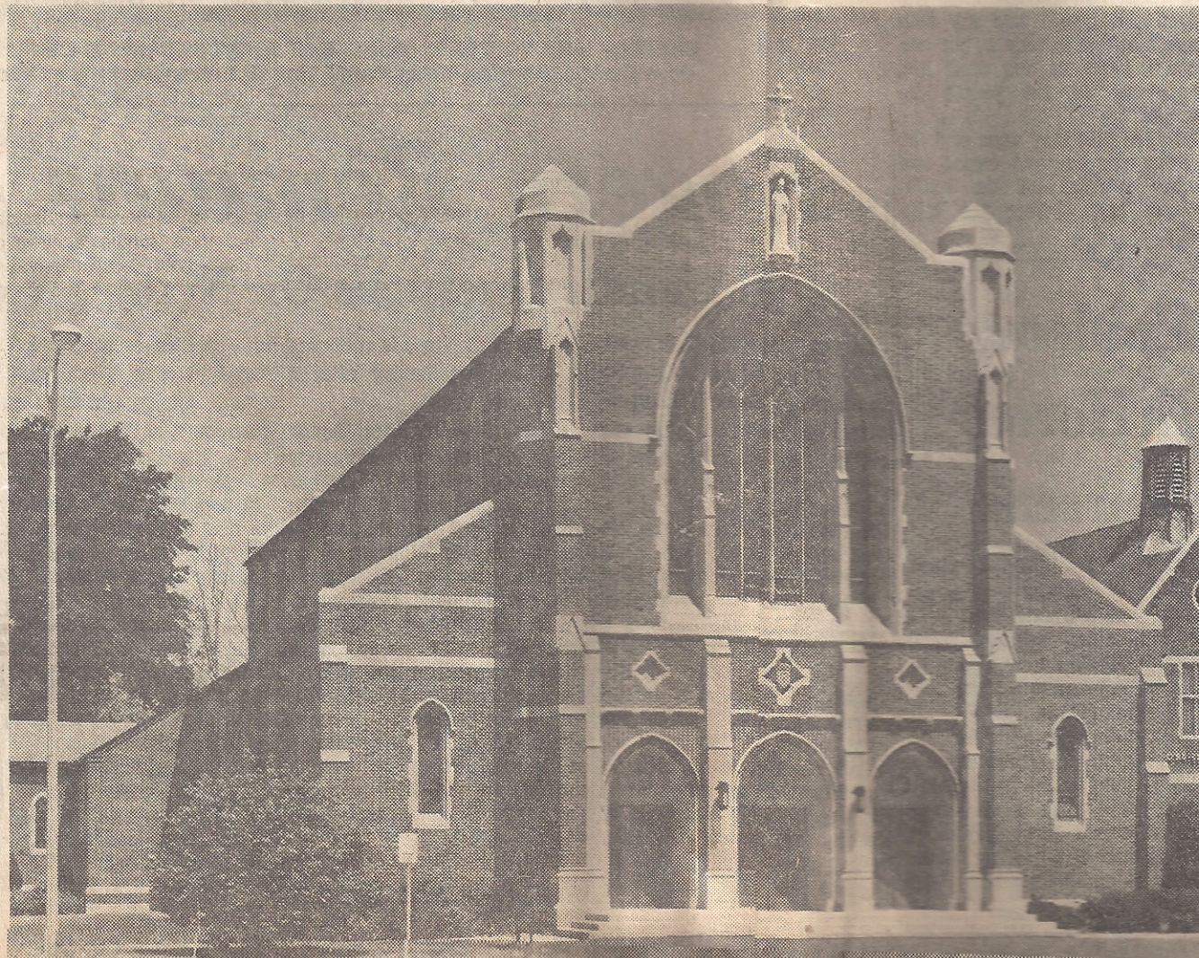
ST. AUGUSTINE CHURCH TO BE KALAMAZOO DIOCESE CATHEDRAL A History Of 115 Years Will Be Highlighted In Ceremonies Wednesday

To do this, the young people will be meeting youth in France, Switzerland, Lichtenstein, Austria, Southern Germany and The Netherlands, staying with host families much of the time.